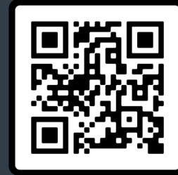
On demand webinars