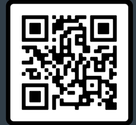
Choosing the right IP